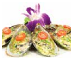
Bake Green Mussels