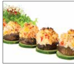
Bake Crabmeat w. Shiitake Mushroom