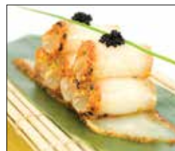
Truffle White Tuna