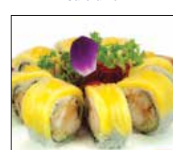
Mango Lobster Roll