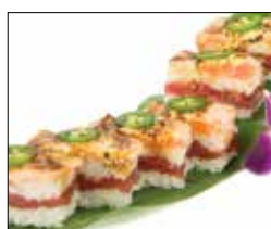
Aburi Salmon Oshi Sushi