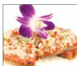
Petunia Tuna Pizza