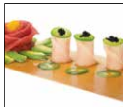
Yuzu Tuna & Yellowtail