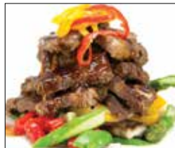
Beef Short Ribs