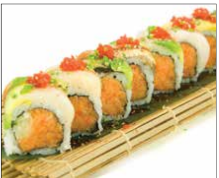
Manhattan Roll $14.95