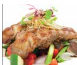
Duck Yu-An Tsukeyaki