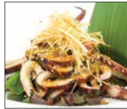
Ikamura BBQ Squid