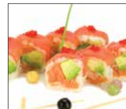
Sasa Salmon Roll